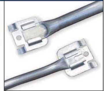
Boltless Front & Rear connections make installation possible without removing any items