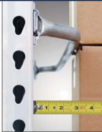
Provides 3" clearance between rack and stored material