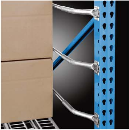
Mechanical guard for transverse flue spaces