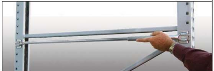
Spring-loaded Fluekeeper is easy for maintenance personnel to install from the aisle side of the rack - requires no special tools or skills

FlueKeeper from DACS US Patent #7,857,152